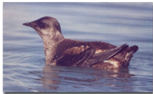
Example of retained old growth habitat and marbled murrelet, a species which prefers this habitat